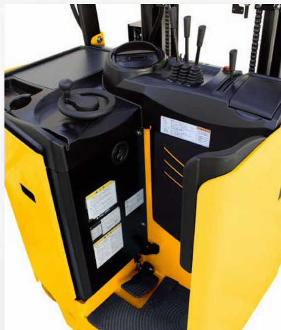
Ergonomic Operator Compartment & Intuitive Controls