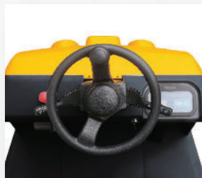
Ergonomic Operator Compartment