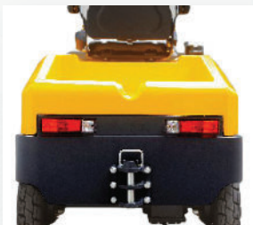
Easy Service Access via Back Cover