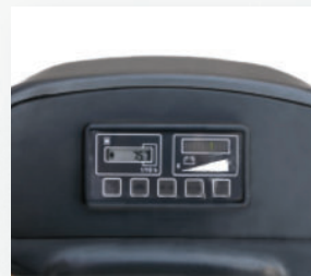
Informative LCD Dash Display